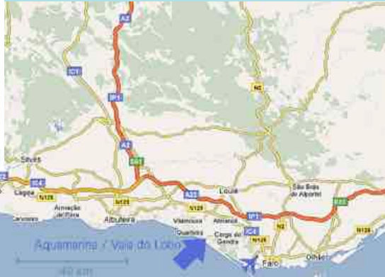
Algarve - Portugal