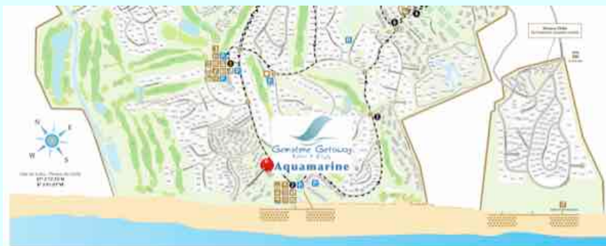
Vale Do Lobo

Discover your DREAM VACATION close to the beach, golf and all services Stunning newly renovated 2 bedrooms/bathrooms villa in the beautiful Aldeamento village of Vale Do Lobo (Portugal), rated the best luxury destination in Algarve. Villa with sea view, 2 minutes walk to the beach, restaurants, golf, spa and other amenities.